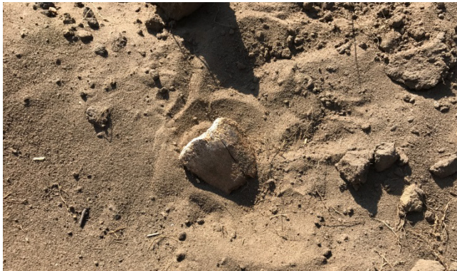
1. Bone found between Km 102 and 103 – Sept 7, 2017