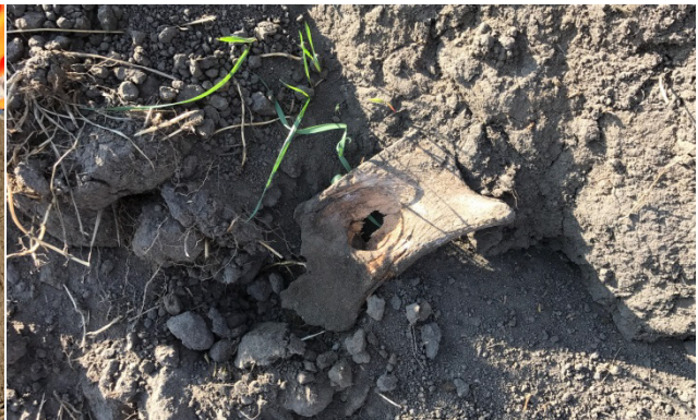
4. Bone found between topsoil pile and transition row, Km 102 and 103 – Sept 7, 2017