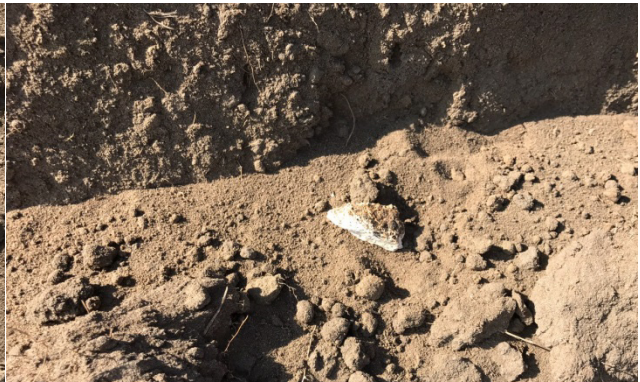
2. Bone found between Km 102 and 103 – Sept 7, 2017