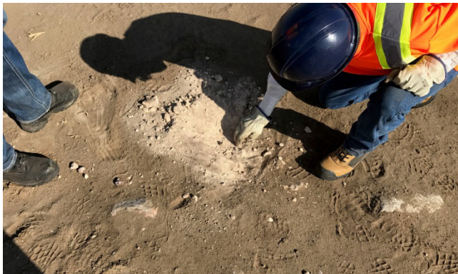
3. Rock circle found at Km 102+300 – Sept 7, 2017